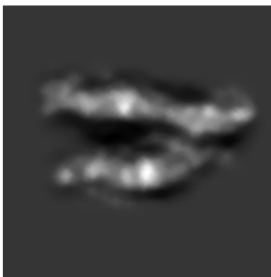
Y Index: 70