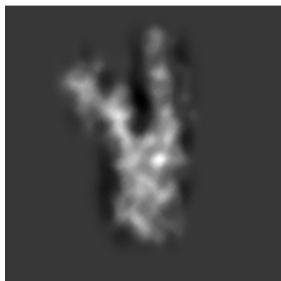
X Index: 80