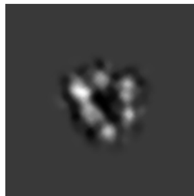
Z Index: 67

The images above show the largest variance slices of the tomogram in three orthogonal directions.