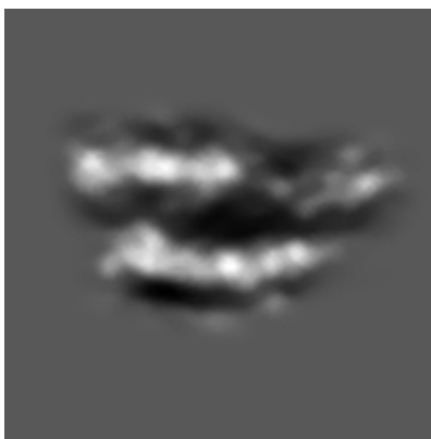
Y Index: 64