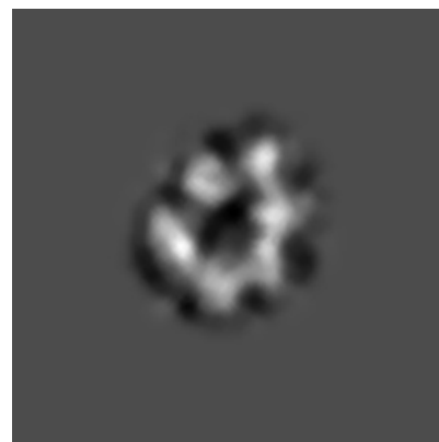
Z Index: 64

The images above show central slices of the tomogram in three orthogonal directions.