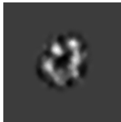
Z Index: 60

The images above show the largest variance slices of the tomogram in three orthogonal directions.