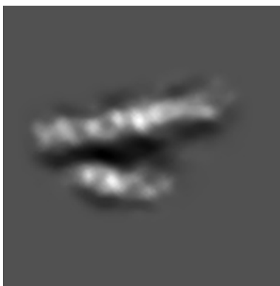
Y Index: 67