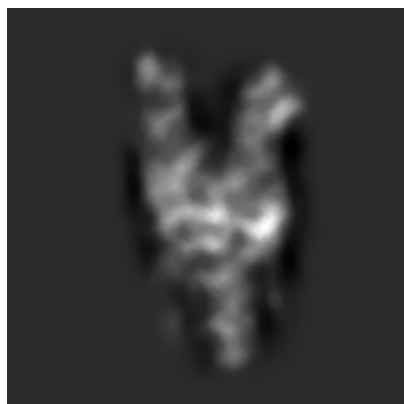
X Index: 75