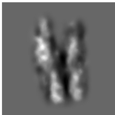
X Index: 64